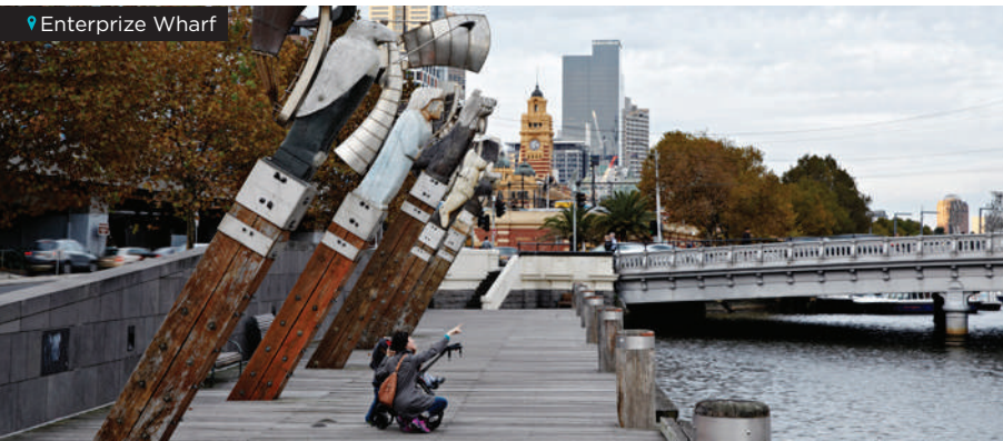
📍 Enterprize Wharf