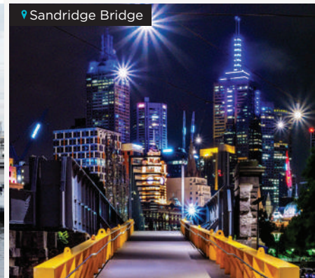
📍 Sandridge Bridge