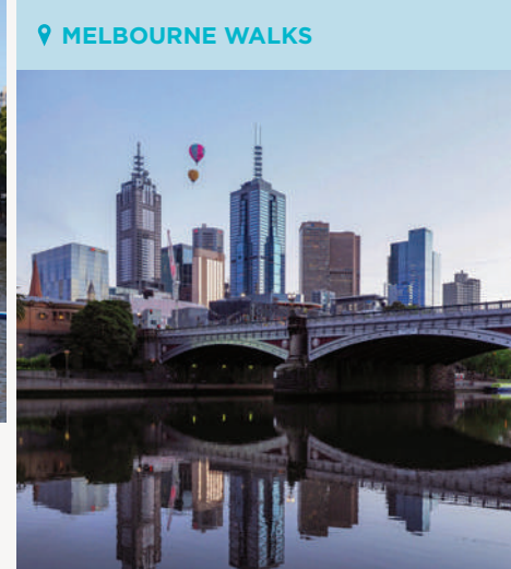
📍 MELBOURNE WALKS