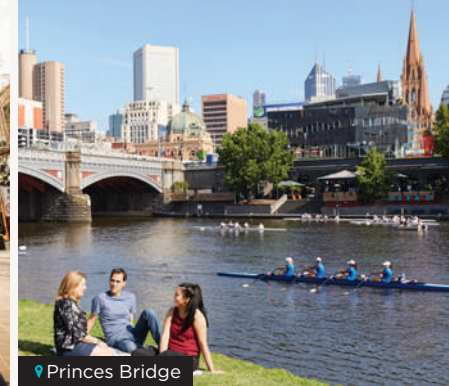
📍 Princes Bridge