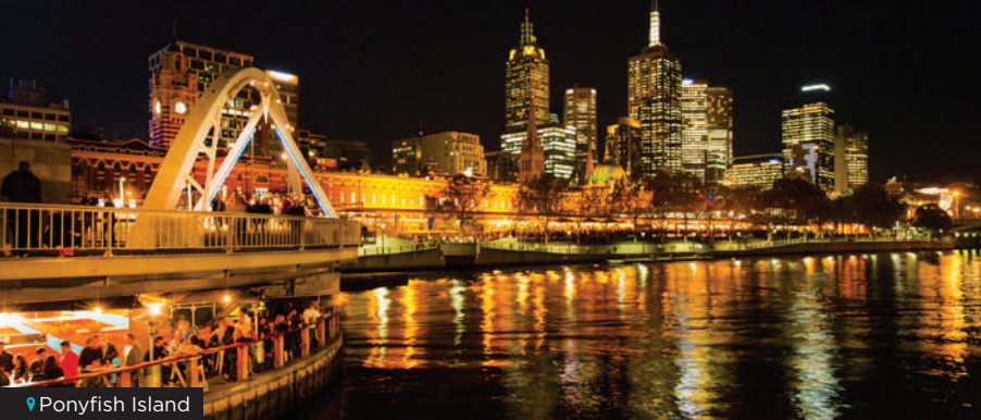
📍 Ponyfish Island