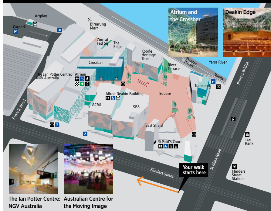
The lan Potter Centre: Australian Centre for the Moving Image