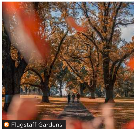
B Flagstaff Gardens

Cover: Queen Victoria Gardens Information correct at time of printing June 2024.