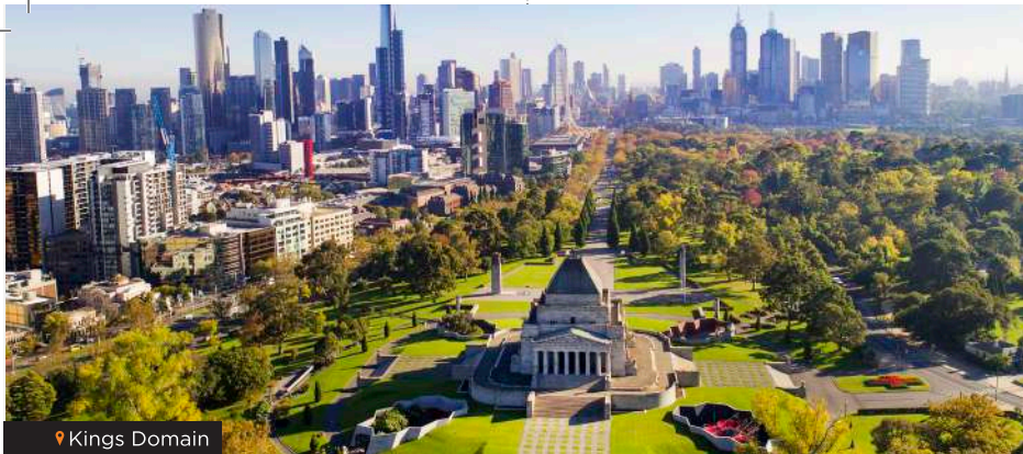
📍 Kings Domain