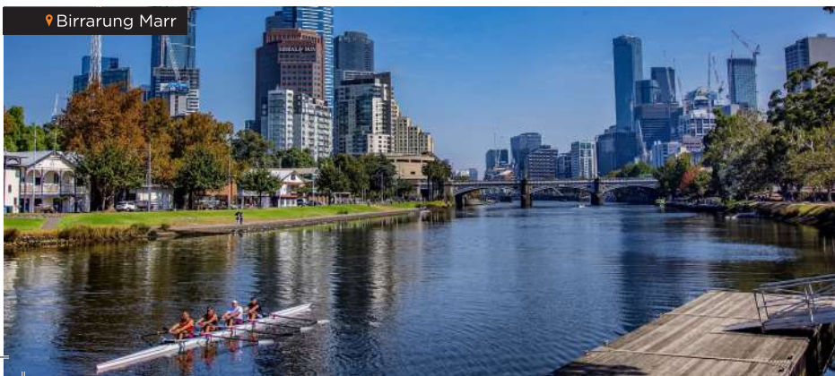
📍 Birrarung Marr