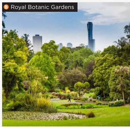
B Royal Botanic Gardens