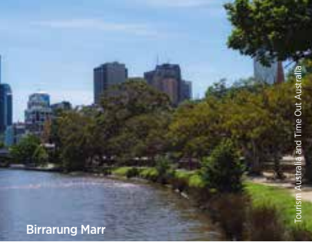
Tourism Australia and Time Out Australia