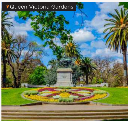
📍 Queen Victoria Gardens