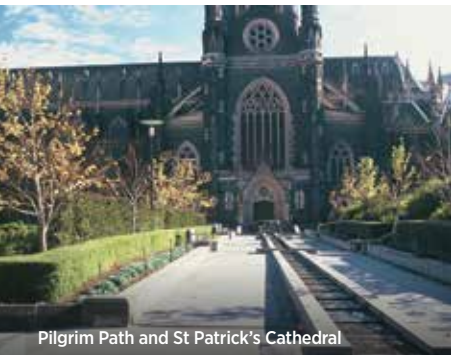
Pilgrim Path and St Patrick's Cathedral

The nearby carved Fairies' Tree (16) and Model Tudor Village (17) are popular with young children, while adults enjoy the elegant fountains and rotundas.