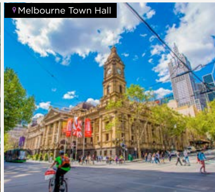
Melbourne Town Hall