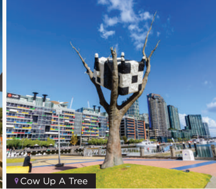
Cow Up A Tree