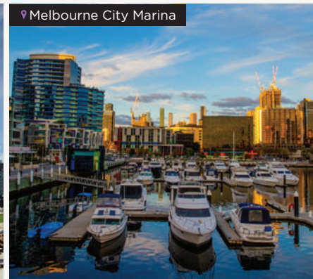
Melbourne City Marina

f /WhatsOnMelb @WhatsOnMelb CityofMelb #MelbMoment