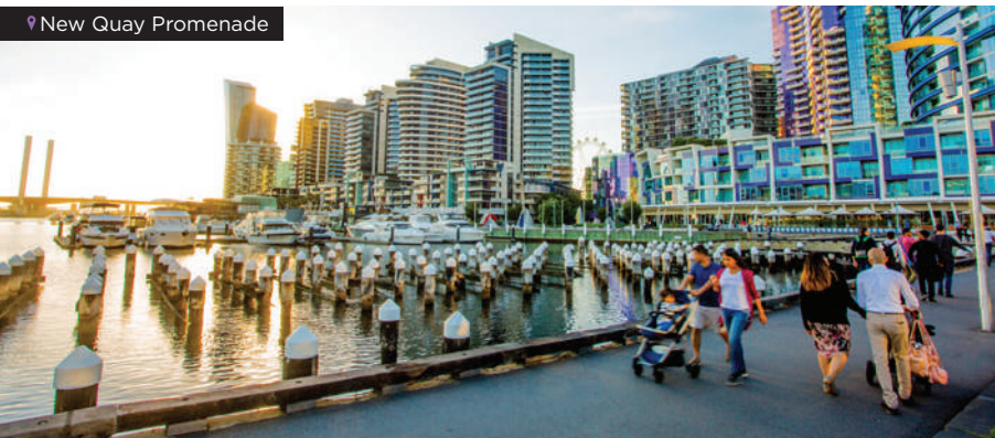
New Quay Promenade